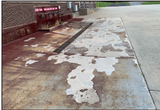
Deck floor coating condition before applications.

Acid with pH <4 rapidly attacks concrete.