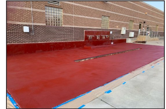
Completed deck with sump prepared for forming with ARC EG-1.