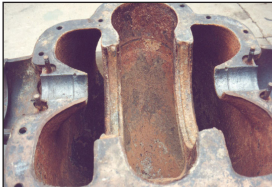
Customer was considering purchasing new pumps at a cost of almost $14K