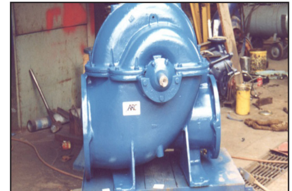
Assembled pump ready for delivery