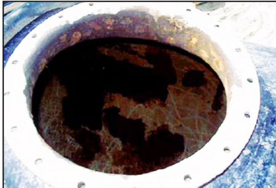
Failed phenolic liner

35% HCL attacks unprotected steel. Road vibration creates cracks in previous lining.