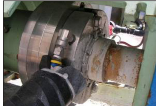
Chesterton 442 Split Seal and ISS mounted on agitator.

Chesterton 442™ Spit Seals were used to seal the agitators. A SpiralTrac™ environmental controller was fitted internally and an Chesterton ISS Safety Seal was also installed as a secondary static sealing device.