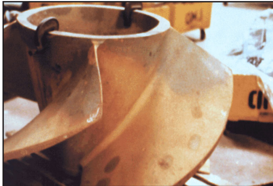
Worn leading edge of impeller

Pumping seawater with entrained sand at a high flow rate caused corrosion erosion damage to impeller, impeller vanes and leading edges.