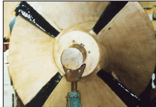
Leading edge rebuilt with ARC 858