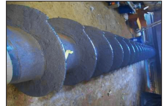
Repaired transport screw