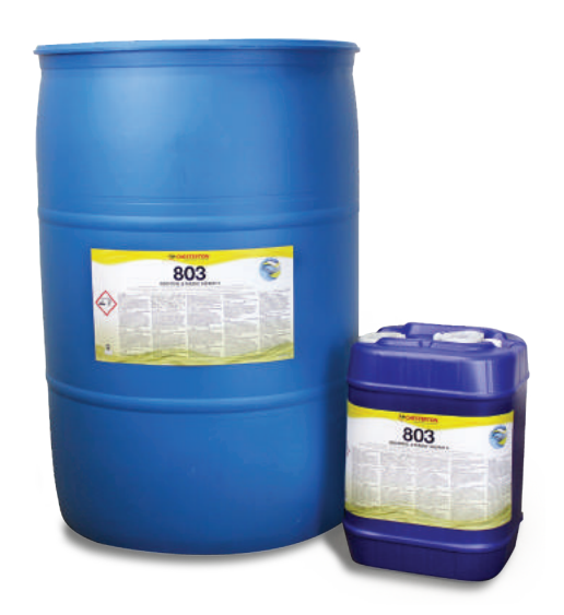
CAUTION: Should not be used on aluminum or metals sensitive to high alkalinity. When using on painted surfaces, test small area for compatibility

Railroad Equipment, and Construction Equipment