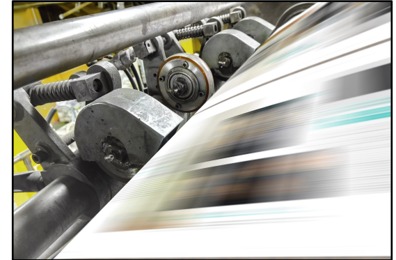
Provides successful operation.

Where previous rubber lip seals lasted one year or less, the Chesterton seals have survived 5+ years – substantially increasing time between maintenance cycles.