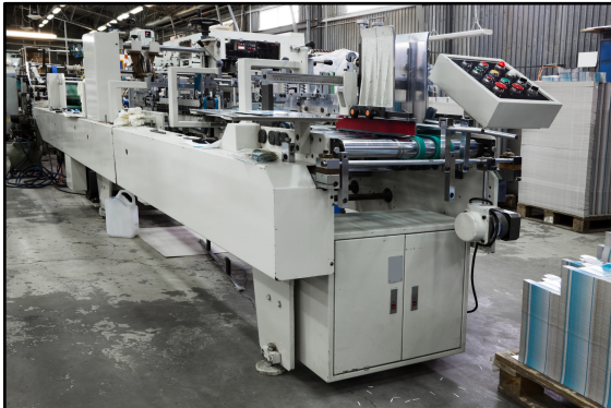
Offset printing press.

This requires seals that can withstand high speeds, pressure, and vibration.