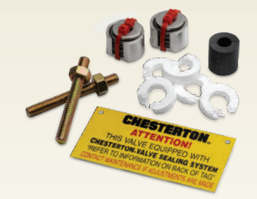
1724E PTFE Sealing System